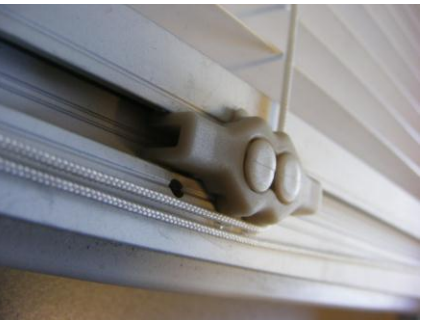
Press on the other side of the aftersales cord guider to insert the legs in the profile. Press one leg at a time.