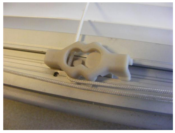
Make sure the cord is guided correctly through the aftersales cord guider