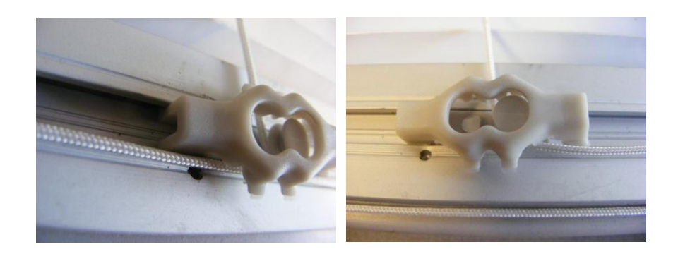
Press on the other side of the aftersales cord guider to instert the legs in the profile. Press one leg at a time.