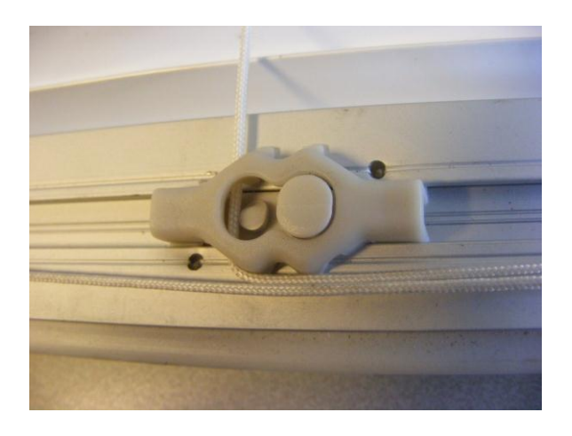
Press on the other side of the aftersales cord guider to insert the legs in the profile. Press one leg at a time.