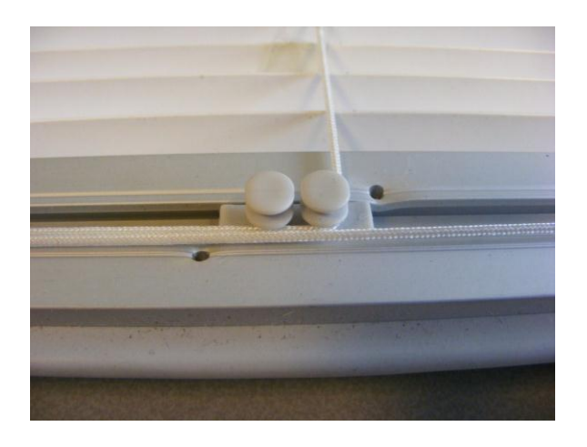
The cord guider