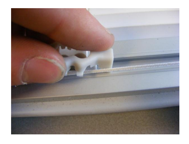
Place the aftersales cord guider over the cord guider