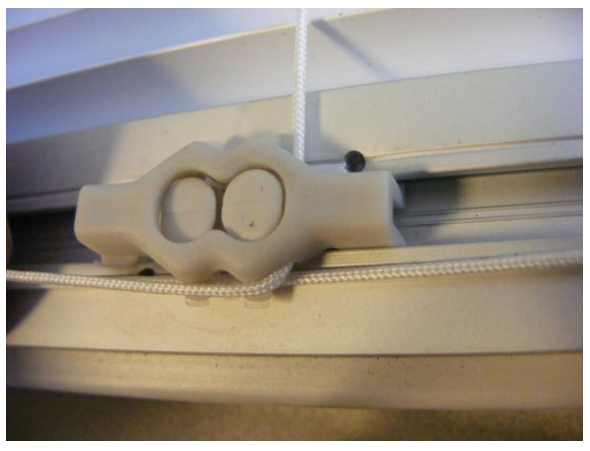
Make sure the cord is guided correctly thrue the aftersales cord guider